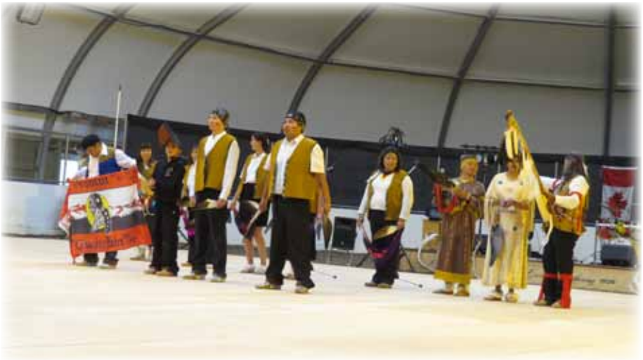
The Vuntut Gwich'in Dancers perform at the ceremony.