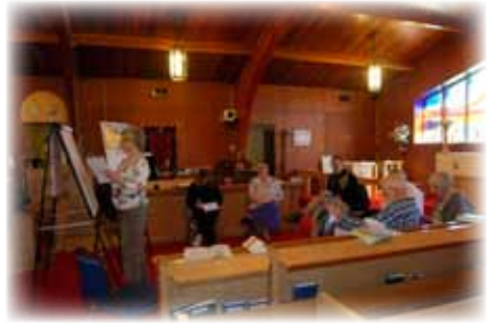
Vestry Retreat at the Cathedral – planning & brainstorming session, 3 May 2014.