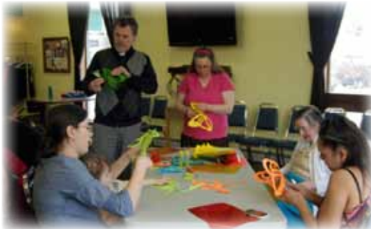
Messy Church, Yukon Style – craft session in Hellaby Hall, 13 Apr 2014.

An early parish work bee also helped improve the general appearance of the Gardens. With one of the best lawns in town, with Christ Church Cathedral and the Old Log Church and Rectory as the prime setting, it is a serene center of Whitehorse.