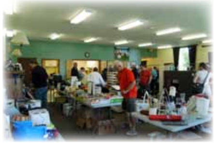
The annual Garage Sale at Christ Church Cathedral, 28 Jun 2014.