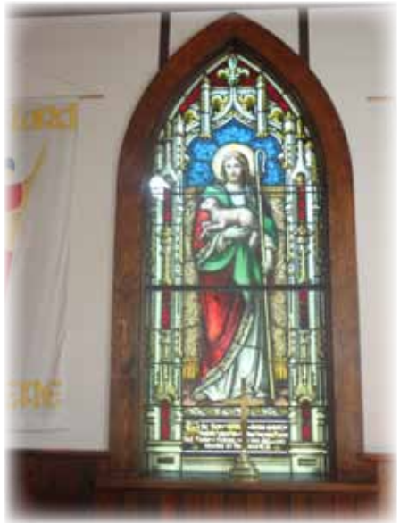
Photos: clockwise from top left: * Saint Savior's in Carcross * Welcome to Carcross * part of the new Carcross Commons * Stained glass window * Canon David Pritchard