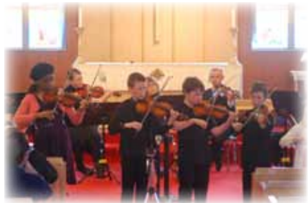
Whitehorse Strings Ensemble spring concert in Christ Church Cathedral, 27 April 2014.