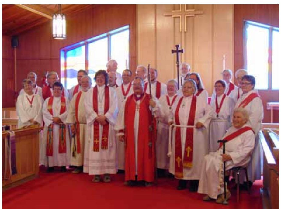
The assembled clergy, deacons and lay ministers of the Diocese.