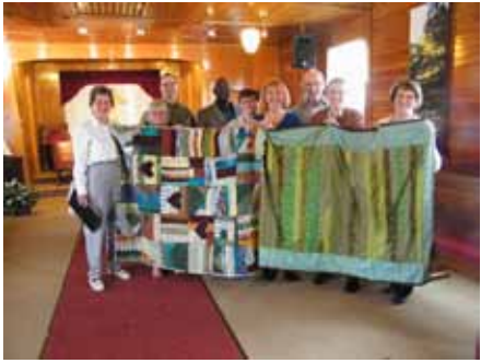
Quilts made by the Comfort Quilters and brought to church for prayers before sending them to recipients