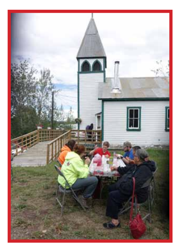
Mayo Church Picnic celebrates visit of Toronto Youth Group