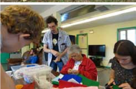
Youth Team visits Saint Mary with Saint Mark in Mayo.