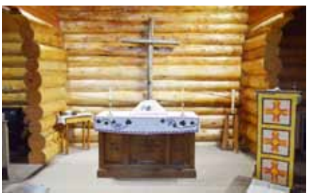
WINTER EDITION DEADLINE: DECEMBER 15, 2016