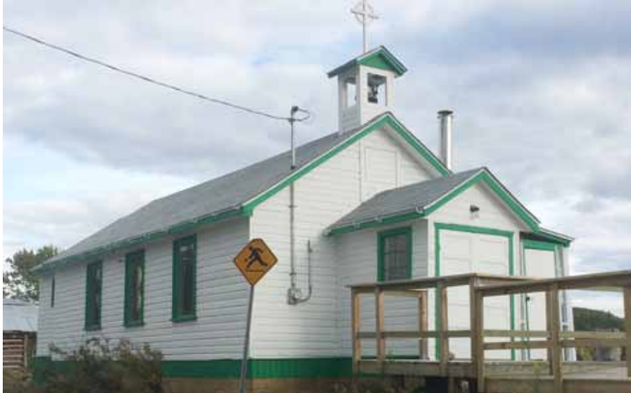
Top to Bottom - continued

Executive Archdeacon Diocese of Yukon Priest-in-Charge, St. Philip's, Teslin