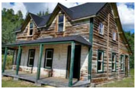
House under repair