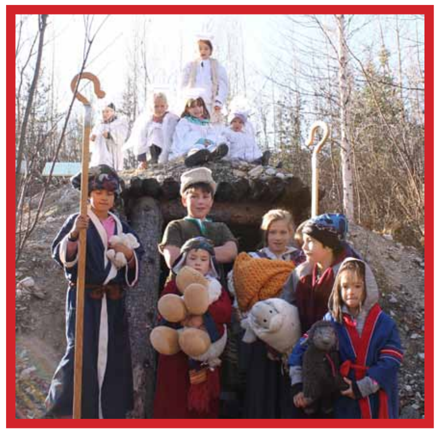
Dawson's churches get ready for the Christmas Eve Pageant Slide Show