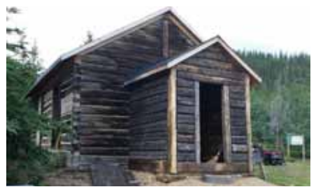
St. Luke's Anglican Church