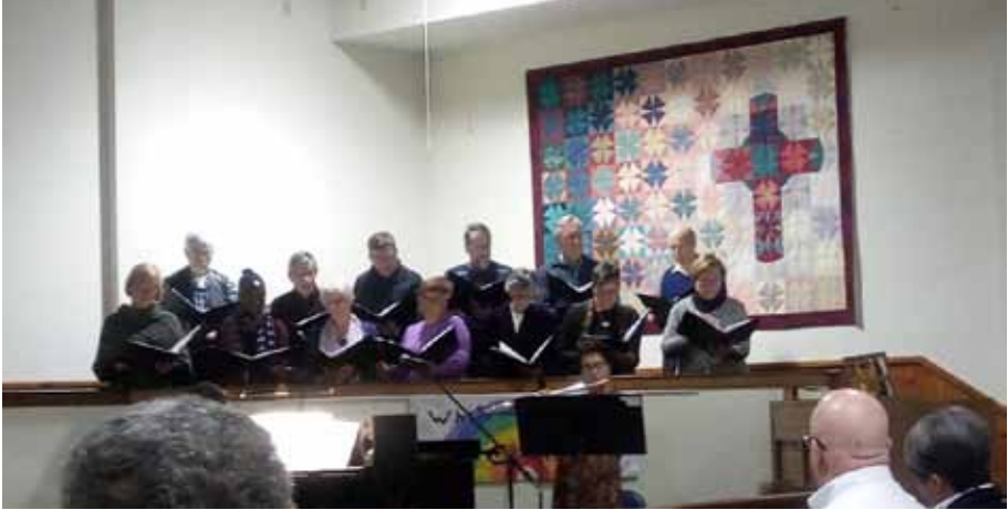
The Common Vision Concert took place at the Whitehorse United Church