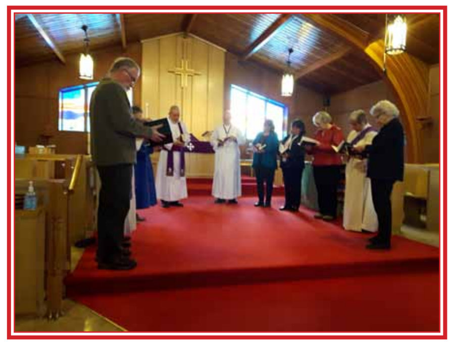
Christ Church Cathedral installs their new Vestry.