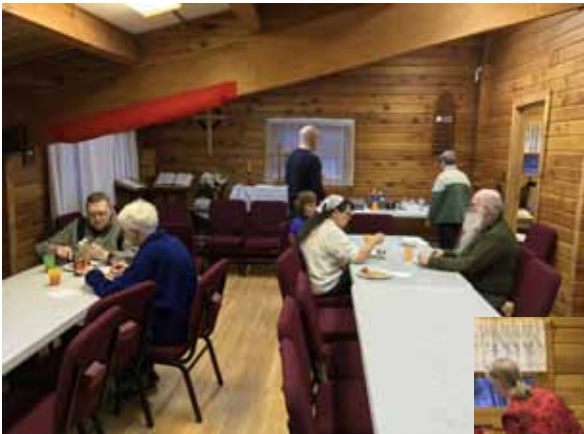
Extremely cold weather and a number of other events, in particular a Tr'ondëk Hwëch'in Elders meeting, reduced attendance at this year's Shrove Tuesday Dinner on February 13.