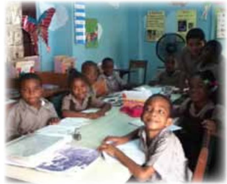
Queens Square Anglican Church school classroom - Belize City