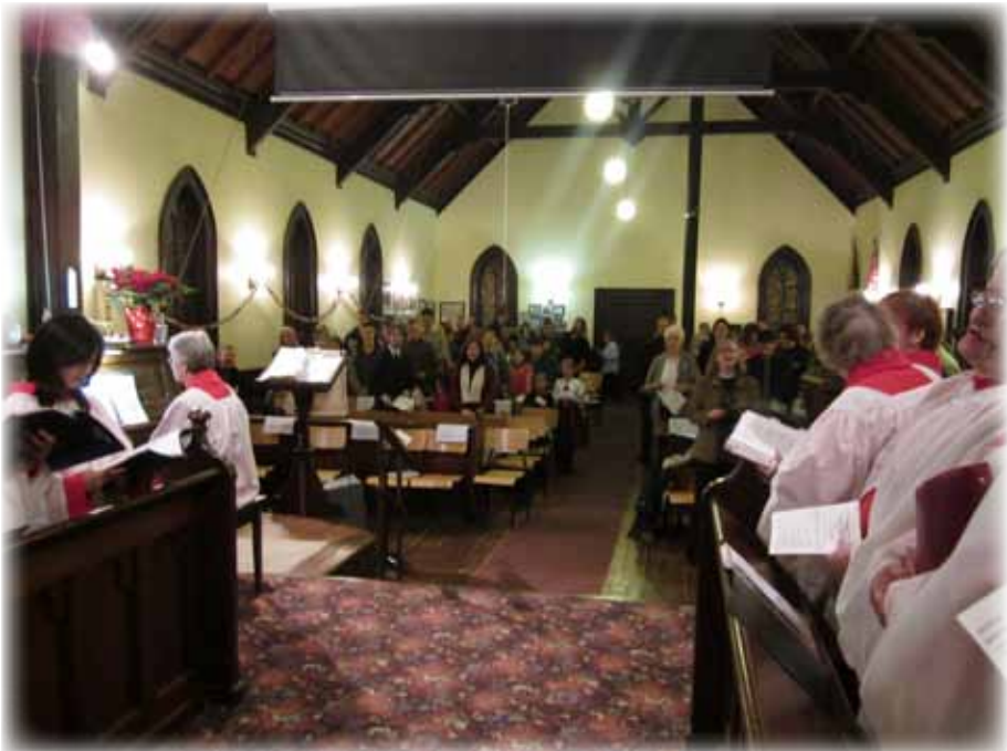
This annual event features the choir, the Christmas Story slide show, and participation by all the town's churches and clergy.