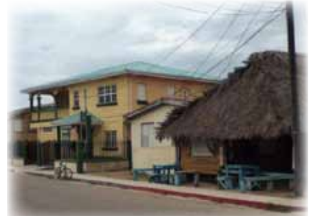
In Dangriga -thatched roof, recreation area. Right next to an affluent residential home