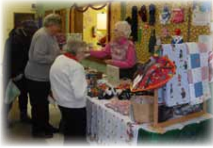
Christ Church Cathedral ACW hosted their annual Christmas Bazaar & Tea in Hellaby Hall, 17th Nov. 2012.