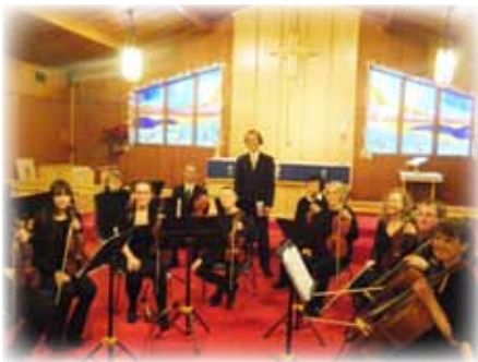
The Whitehorse Strings Ensemble is seen just after their annual Fall concert in Christ Church Cathedral, and at the reception which followed on 9th Dec. 2012.