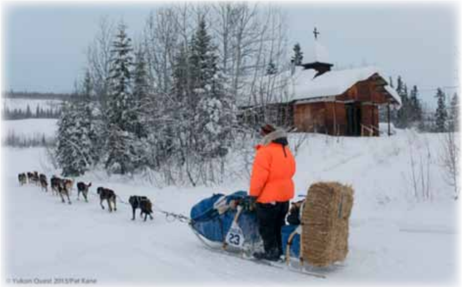
A Yukon Quest Musher racing his team by St. James the Lord's Brother in Pelly Crossing

We are getting ready for Easter and have a Baptism service Easter Morning. Please keep us all up here in your prayers.