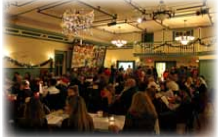
The Oddfellows Hall ballroom was packed for the Christmas Music Extravaganza.