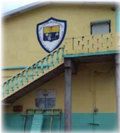
Christ the King Anglican Church School in Dangriga