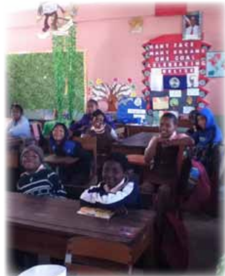
Queen's Square Anglican School - welcome to our classroom