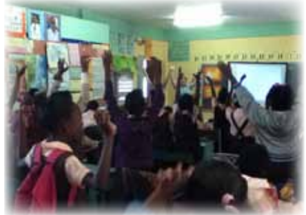
Queens Square Anglican Church school- performance "I depend in you" - Belize City