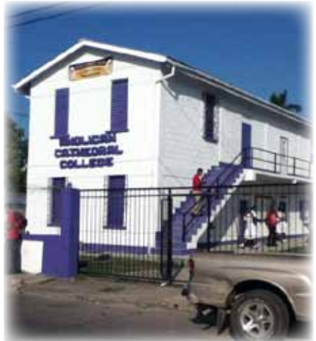
Anglican Cathedral College - high school next to St John's Cathedral - Belize City