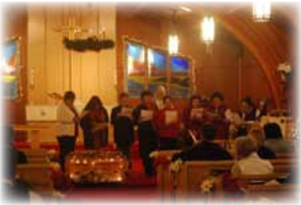
The First Nations choir singing at the Christmas Eve Service in Christ Church Cathedral, 24th Dec. 2012.

Scenes for the Ash Wednesday Service , with the Cathedral, Northern Apostles and Trinity Lutheran Churches.