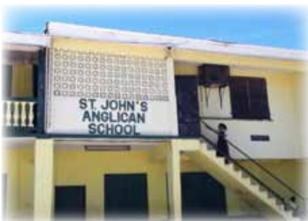
St John's Anglican School - Belize City