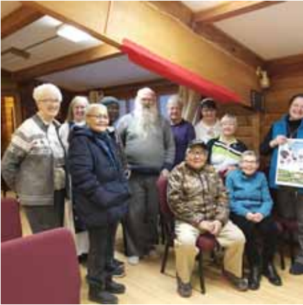
Raising money for PWRDF Buying the Farm through World of Gifts - Tanzania, Mozambique and Burundi