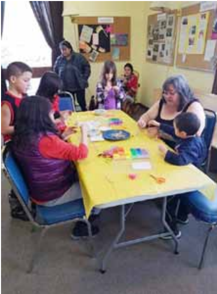
Above is a photo of working on a “Bible Message in a Vial Craft” at our Feb 17, 2019 Messy Church at Christ Church Cathedral, in which the theme was “Read Your Bible.”