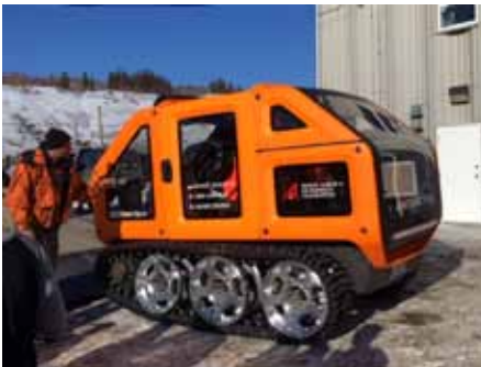
"Antarctica" - a zero emissions vehicle which will be used for exploration in Antarctica.

This was an incredible blessing and a much needed event for the community to come together and have this awesome presentation on their road to healing.