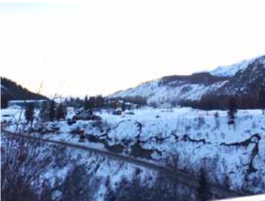
The forefront of the picture shows that several houses are missing as well as the Roman Catholic church and rectory and the nurses residences.

The Dease Lake and Telegraph Creek portion of the trip was very difficult. It was the first time I had been in since the fire and although I took some pictures it is difficult to see the overwhelming sense of loss. Twenty-one homes were lost and also many of the cultural facilities such as the head start building. It was wonderful to see some of the people who were staying in Dease but the majority of Telegraph Creek residents were not back yet and no residents were back in the community.