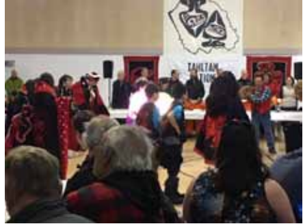
Members of the community and the Expedition team members watch the Tahltan drummers and dancers.