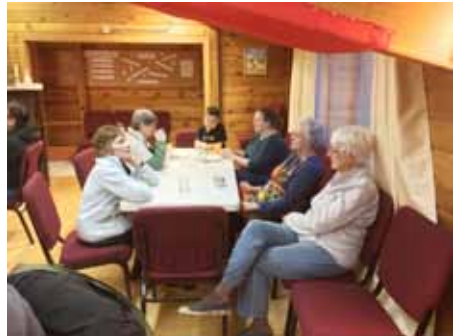
Eating wonderful pancakes and raising $470 for PWRDF equity in the Canadian Foodgrains Bank for food projects in Yemen, and for the Rohingya refugees.