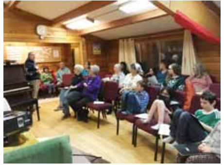
World Day of Prayer 2019, with a focus on Slovenia.