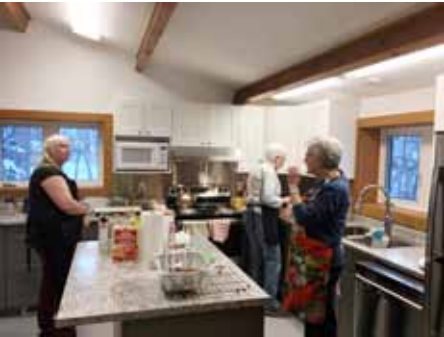
Cooking for our Shrove Tuesday Pancake supper in the Richard Martin Chapel's NEW KITCHEN.