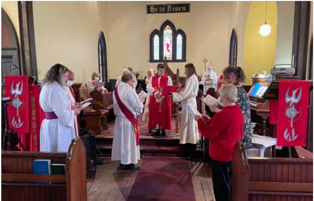
The postulant is presented to the Bishop at St. Paul’s.