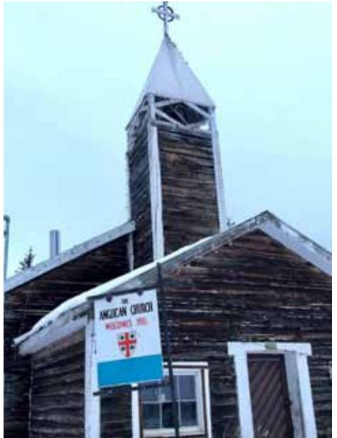
This is the "old" St Luke's, which will hopefully be repaired soon. This was built in 1959.